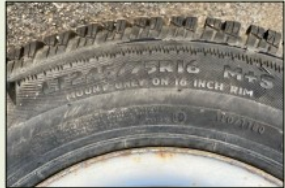
TIRE SET #1 ⇒ ARCTIC CLAW TIRES & RIMS (4) – LT245/75R16