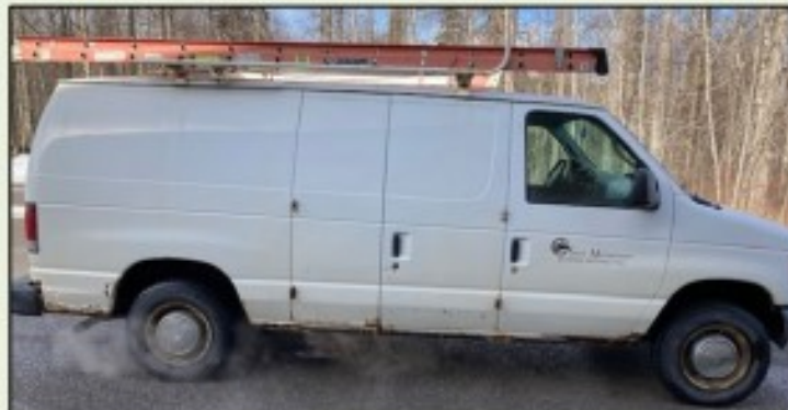
UNIT #0643 ⇒ 2006 Ford Econoline Van - V8 Engine - Automatic Transmission - 267,560 Kilometres