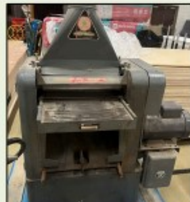
EQUIPMENT #4 ⇒ Delta 18" Thickness Planer – 240 Volt