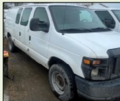
UNIT #0941 ⇒ 2009 Ford Van - V8 Engine - Automatic Transmission - 108,601 Kilometres