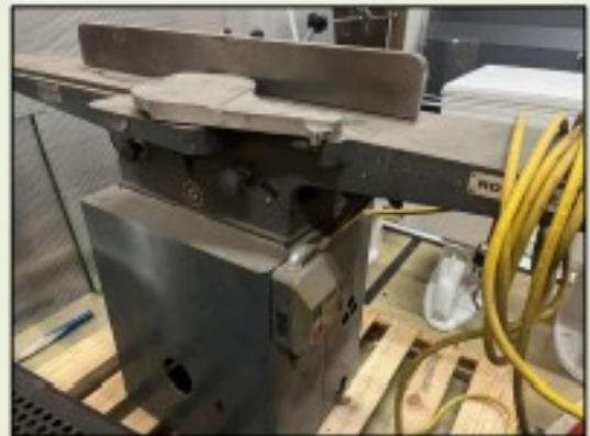
EQUIPMENT #3 ⇒ Delta 8" Jointer – 240 Volt