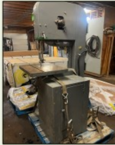
EQUIPMENT #5 ⇒ Delta 20" Bandsaw – 240 Volt