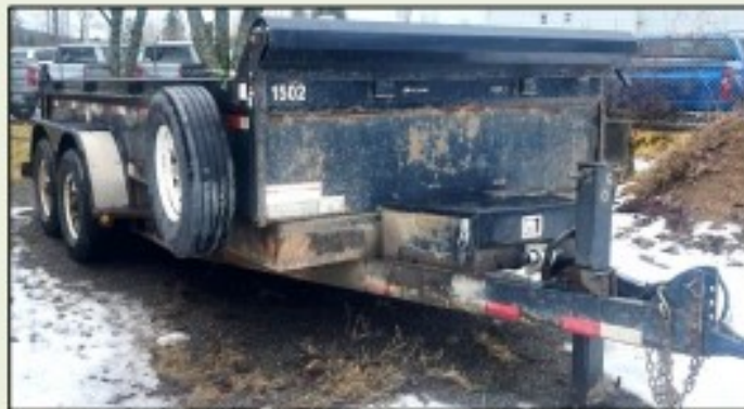
Unit #1502 ⇒ 2015 HI Tech Dump Trailer - 14 feet long, 7 feet wide