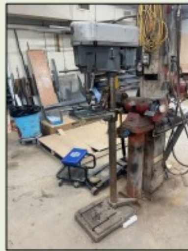
EQUIPMENT #7 ⇒ Rockwell Drill Press– 240 Volt