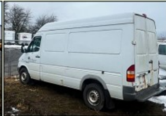
UNIT #0621 ⇒ 2006 Dodge Sprinter Van - 5-Cylinder Engine - Automatic Transmission - 189,836 Kilometres