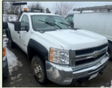
Unit #0951 ⇒ 2009 Chevrolet Silverado Truck with Sander/Front Plow (Sander/Front Plow available at public viewing) V8 Engine - Automatic Transmission - 188,279 Kilometres