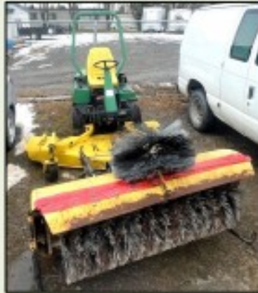
EQUIPMENT #1 ⇒ John Deer Mower/Sweeper