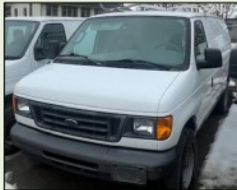
UNIT #0642 ⇒ 2006 Ford Van - V8 Engine - Automatic Transmission - 204,807 kilometres