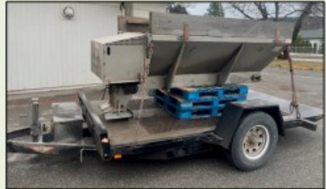
EQUIPMENT #2 ⇒ Model P Gas Powered Sander for Back of Pick-Up