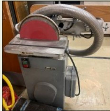
EQUIPMENT #6 ⇒ Rockwell Combo Sander – 240 Volt