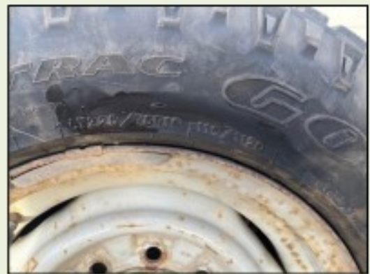
TIRE SET #3 ⇒ GOODYEAR TRAC TIRES & RIMS (4) – LT225/75R16