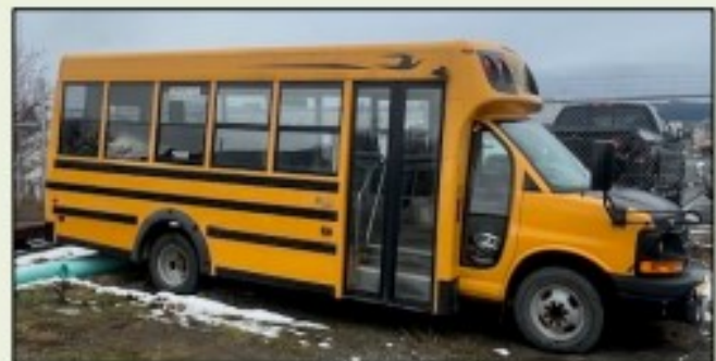
UNIT #75206 ⇒ 2014 Chevrolet 24-Passenger School Bus - V8 Engine - Auto Transmission - 53,666 kilometres