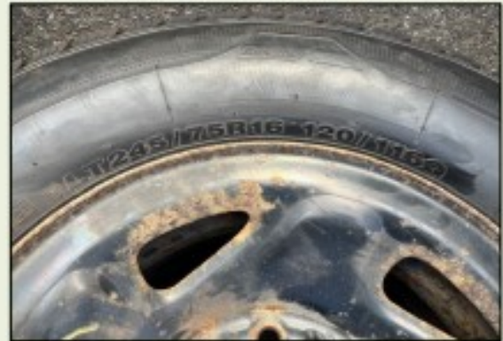
TIRE SET #2 ⇒ KUMHO TIRES & RIMS (4) – LT245/75R16