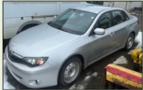
Unit #1001 ⇒ 2010 Subaru Impreza Car - 4-Door - Automatic Transmission - 137,614 Kilometres