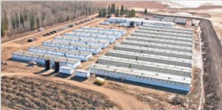
800-person work camp on Coastal GasLink pipeline

The City of Terrace described its experience with Coastal GasLink Pipeline: