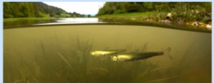
Salmon smolts in the Skeena estuary

When a pipeline is finished, it is pressure-tested with water. Each km of the 48"-diameter PRGT pipeline would require more than 1100 cubic metres of water. This water, taken from the Skeena watershed, could fill 70 Olympic-sized swimming pools – the daily water use of one-half a million Canadians. After testing, the water – contaminated with biocides, oils, and welding slag – would be discharged back into the watershed.